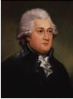
The original of this portrait of Thomas Clarkson by Carl Frederik von Breda hangs in the National Portrait Gallery in London.

Clarkson, born in Wisbech in 1760, was a 25-year-old Cambridge student when he decided to try his luck in the essay contest. He