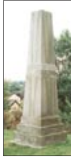
This marker along a road near London commemorates the spot where, in 1785, an anguished Clarkson dismounted his horse, fell to his knees and resolved to commit his life to the antislavery cause.

More than two centuries later, that very spot is marked by a monument, not far from London.