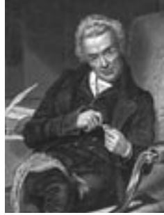
Short in stature and in ill health for much of his life, William Wilberforce, the antislavery movement’s best friend in Parliament, is remembered today as a great orator and a towering figure in British history.

Wilberforce was a hero in his own right — but Thomas Clarkson was prominent among those who first proposed to Wilberforce that he be the movement’s man in Parliament. Moreover, it was the information Clarkson