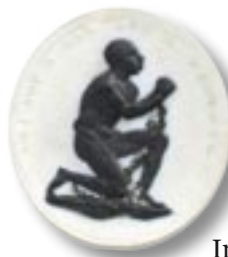
The great pottery entrepreneur Josiah Wedgwood, a Clarkson ally, commissioned the creation of this image. "Am I Not A Man And A Brother?" appeared on medallions and plates and in many other media to powerful effect.

Clarkson's committee also enlisted the help of famed pottery maker Josiah Wedgwood in producing a famous medallion with the image of a kneeling, chained black man, uttering the words, "Am I not a man and a brother?"